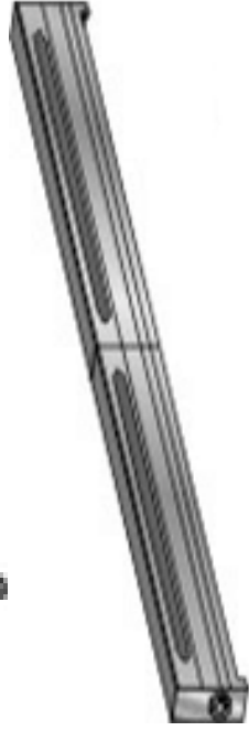
Cast Iron Baseboard Length in Feet