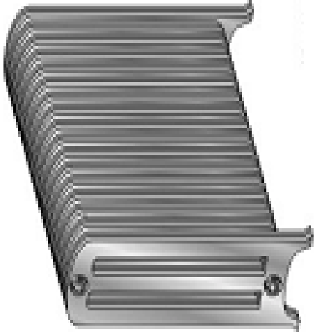
Column Type Radiator Example; 3 Column